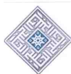
War in Saada: The Yemeni Military Offensive against the Houthi Rebels