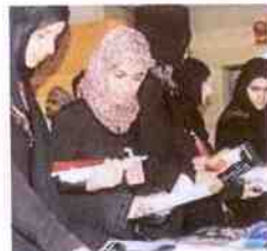
Oman's colourful culture – revering historical treasures