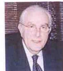
Body of Slain

The main objective of Wadi El Nil Association, the implementing arm of the program, is to tackle the issue of child labor in the limestone quarries. It is estimated that there are at least 3,000 children currently working in this sector below the age of 18. They work up to 12 hours per day and earn between $0.85 – $2.50/day. The project aims to provide 50 children with an alternative to quarry work through providing vocational training and access to small loans, as well as loans to 125 families so that they depend less on their children's incomes.