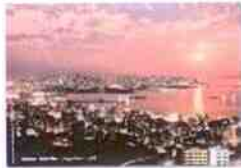
Sleepless in Beirut, sin city of the Middle East