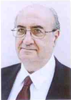
Girl soldiers are neglected casualties of war